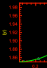
( \times 10^{-2} ) PLp